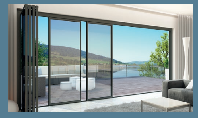
slide & turn doors