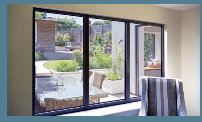
windows & doors