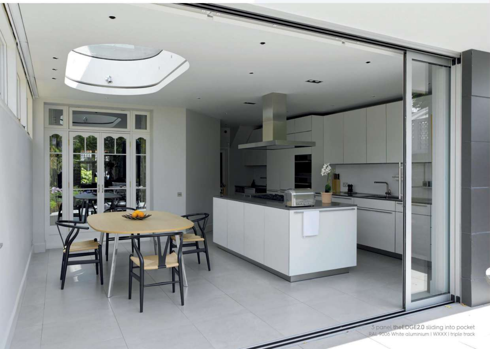
3 panel theEDGE2.0 sliding into pocket RAL 9006 White aluminium | WXXX | triple track