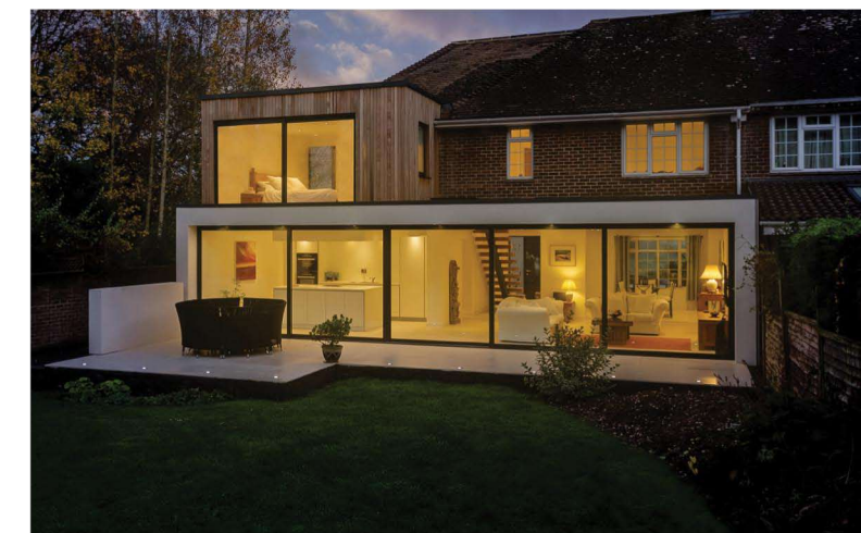
First floor: 2 panel Grand Slider II sliding window RAL 7016 Anthracite Grey | XO I twin track Ground floor: 5 panel Grand Slider II sliding doors RAL 7016 Anthracite Grey | PXXXO I twin track

We offer the widest range of system options, a multitude of configuration layouts and the ability to completely open up corners or slide doors into a pocket behind a wall - all designed and manufactured with the quality you would expect from IDSystems.