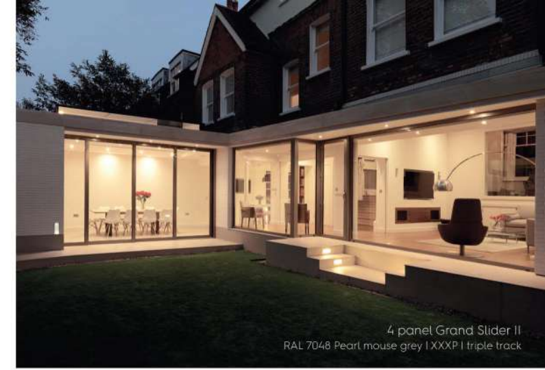
4 panel Grand Slider II RAL 7048 Pearl mouse grey | XXXP | triple track