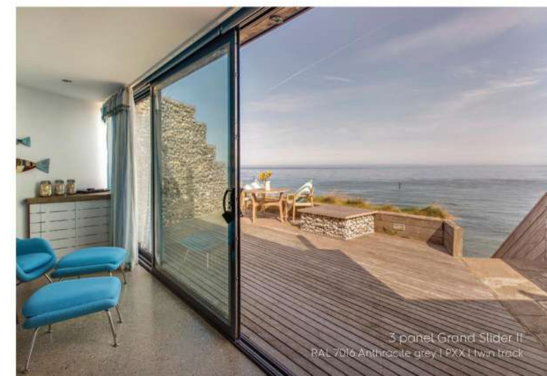
3 panel Grand Slider II RAL 7016 Anthracite grey | PXX | twin track