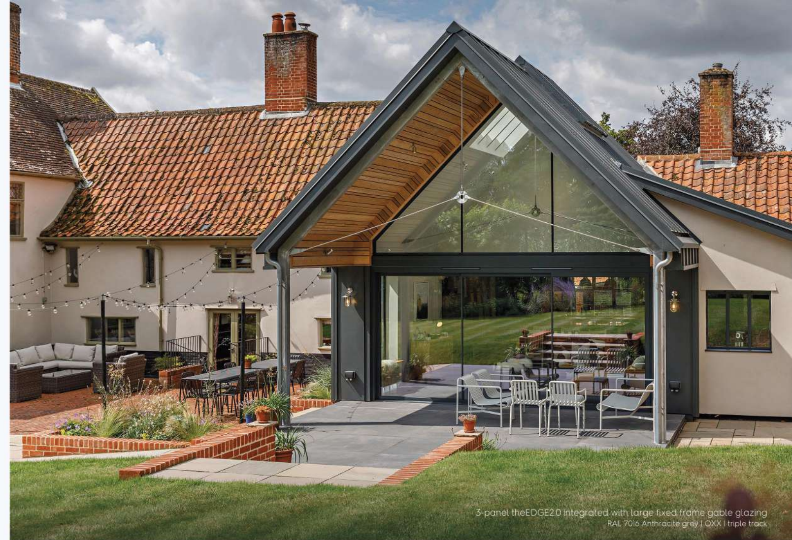
3-panel theEDGE2.0 integrated with large fixed frame gable glazing RAL 7016 Anthracite grey | QXX | triple track

A grab handle recessed into the frame of the panel and used to initially open or close the doors. Available colour-matched to the finish of the doors as standard.