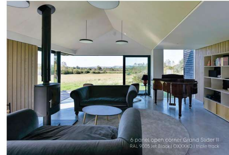
6 panel open corner Grand Slider II RAL 9005 Jet Black | OXXXXO | triple track