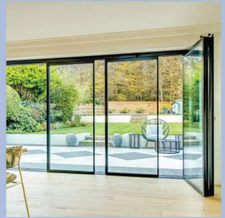
slide & turn doors