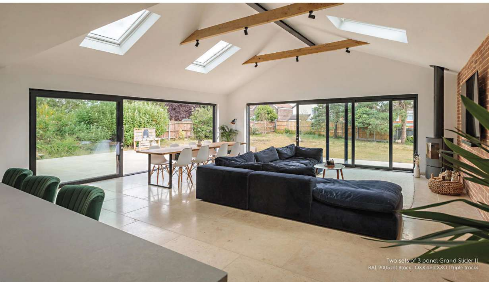
Two sets of 3 panel Grand Slider II RAL 9005 Jet Black | OXX and XXO | triple tracks