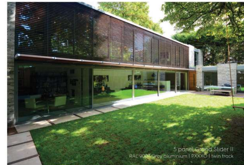
5 panel Grand Slider II RAL 9007 Grey aluminium | PXXXXO | twin track