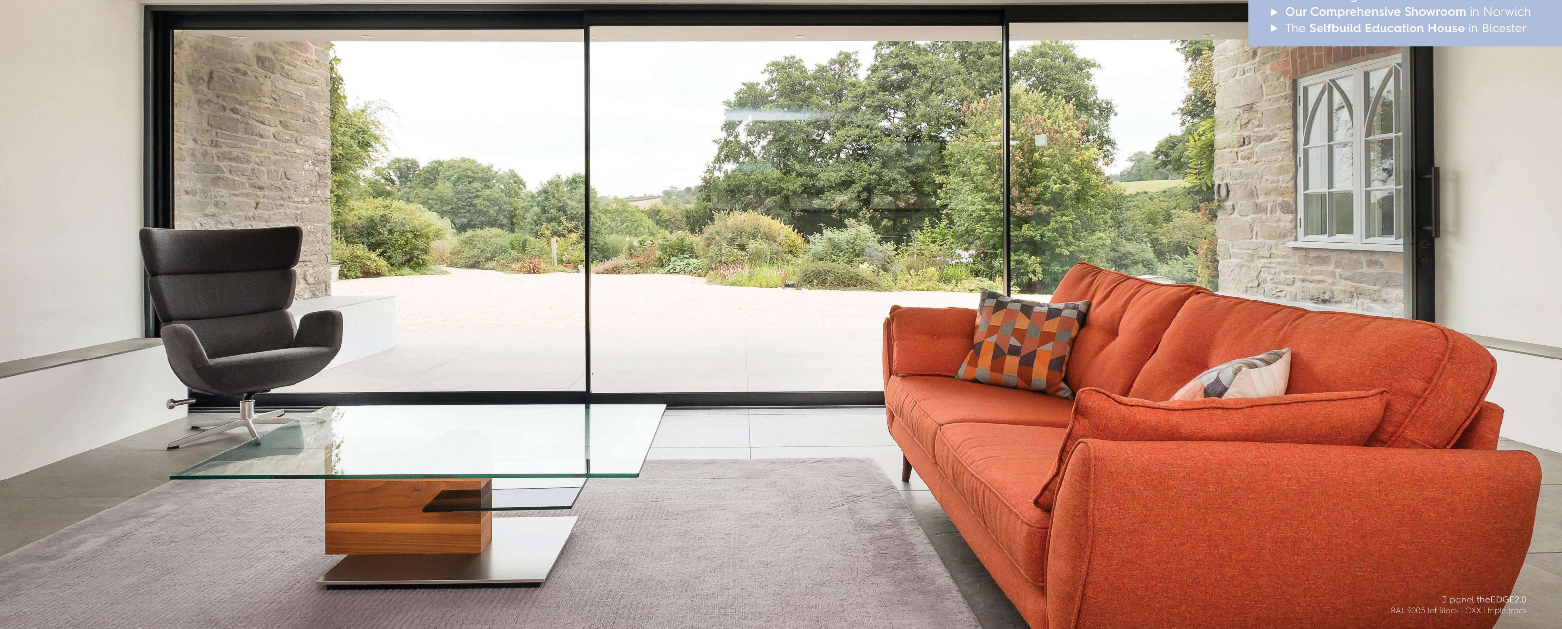
3 panel theEDGE2.0 RAL 9005 Jet Black | OXX I triple track