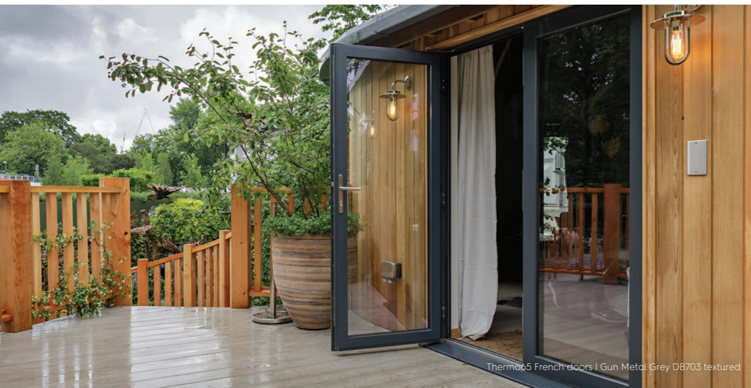
Thermo65 French doors | Gun Metal Grey DB703 textured

The doors are available with a range of glass options including clear, satin or even patterned glass. The doors can be double or triple glazing and can be specified with laminate glass to provide the ultimate in security protection.