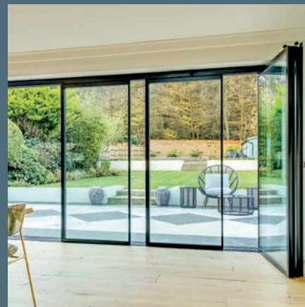
slide & turn doors