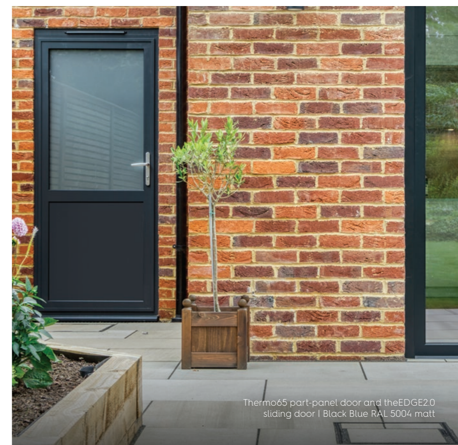
Thermo65 part-panel door and theEDGE2.0 sliding door | Black Blue RAL 5004 matt