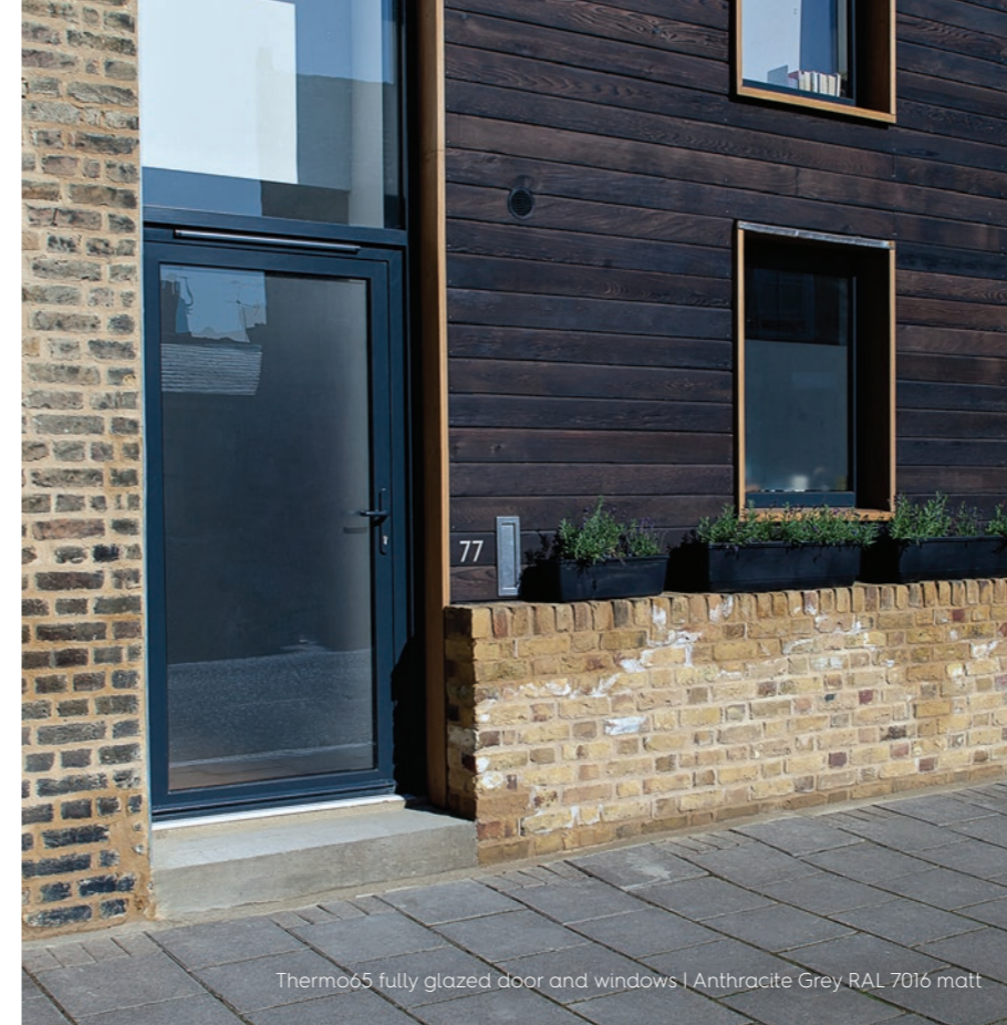
Thermo65 fully glazed door and windows | Anthracite Grey RAL 7016 matt

For larger apertures they can be included as part of our glass curtain walling solution or combined with fixed frame windows to create contemporary glass facades.